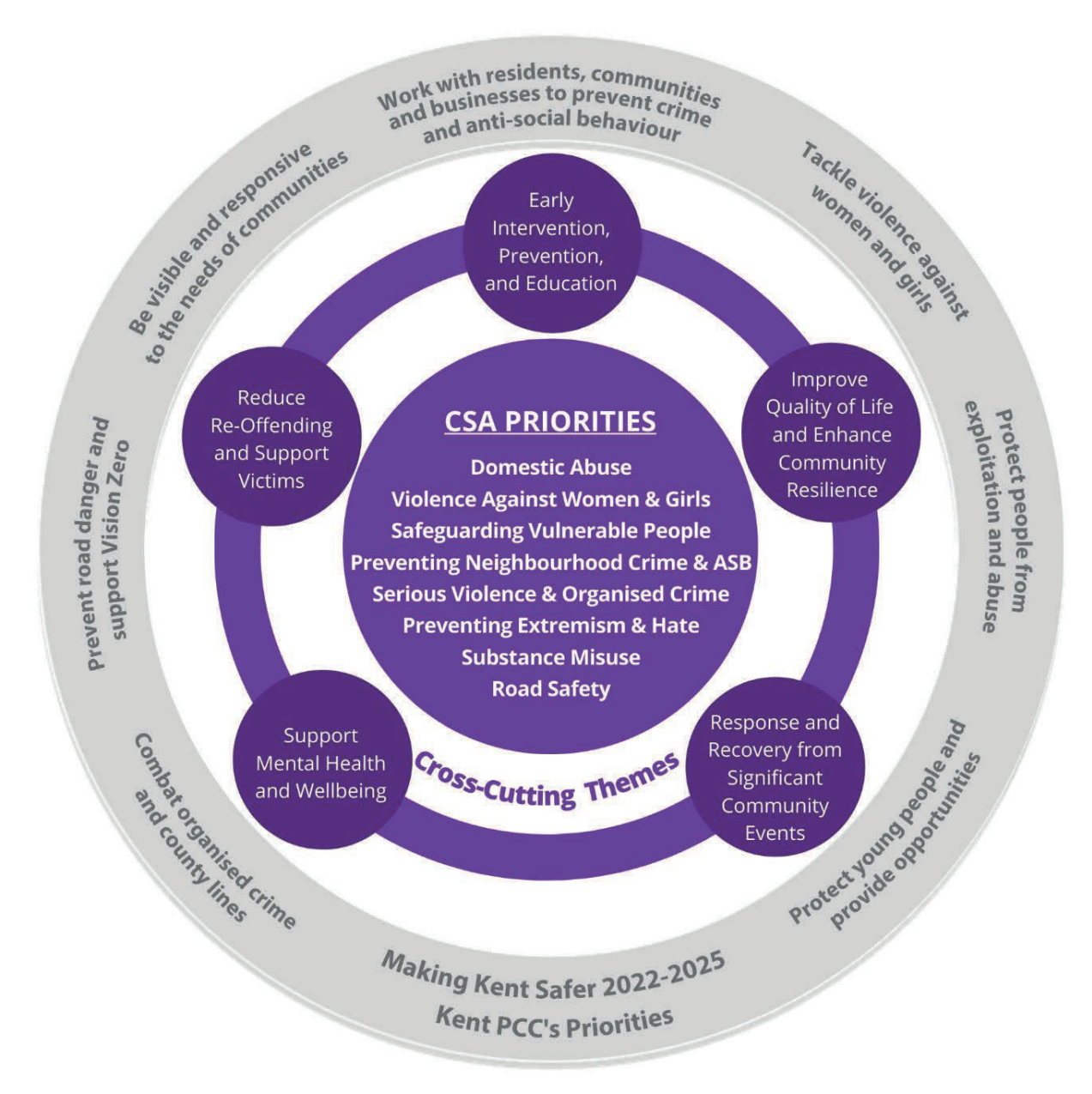
ASB = anti-social behaviour